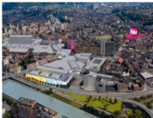
mediacité proposed site

Liege and its region are currently experiencing a boom in the cinema industry with local prestigious and energetic studios – such as the Dardennes' Les Films du Fleuve, Versus Production, Tarantula and Les Films de la Passerelle – all producing prize-winning films (which include, besides those by the Dardenne brothers, The Axe , Ultranova , The Weakest Is Always Right and Congorama ).